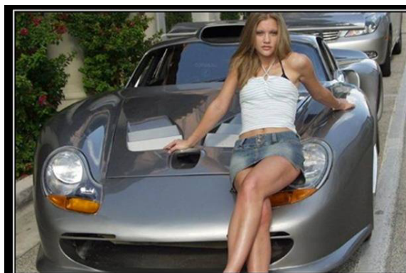
In the long run, the car will be cheaper...

By the way, also check out our CLASSIFIED section for any new aviation and PPC stuff. Also check out our FEATURED VIDEO clip on the front page for the latest addition of video clips. Check out the INSTRUCTION WEBSITE tab also, as that site pretty much has all the information you need to get your license, to stay current, to keep you legal, and to advise your friends regarding all the new rules and regulations.