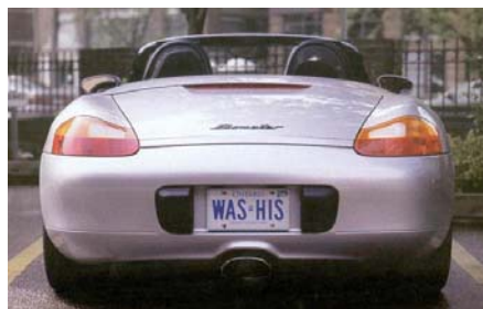
Yes, divorce can be expensive...