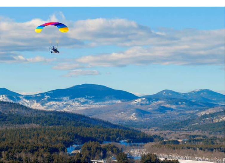
Another wonderful winter flying picture. Is it working?

Two more reasons it's great to be old - People no longer view you as a hypochondriac, and your secrets are safe with your friends because they can't remember them either.