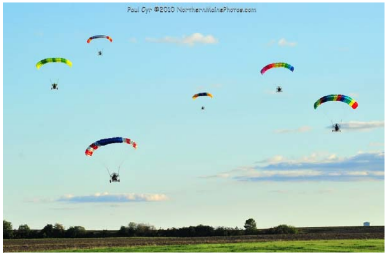
I guess you could call that formation flying...

of those in our club - see our instruction web site www.ppc-instruction.com for names and numbers.