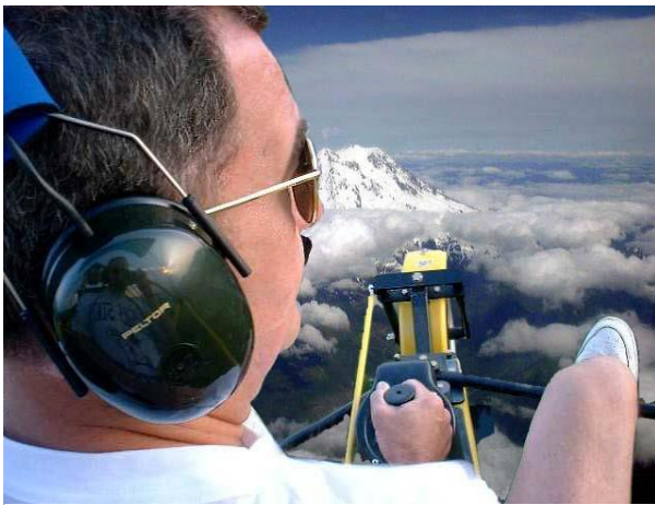
Here's one of my favorite winter flying pictures - me, flying over Mt. Kilimanjaro at 19,400 feet. Oxygen & long pants are for sissies.

We'll bring this issue up at our annual meeting at our Christmas party to see if there's enough interest. We need to have at least 10 people to make the event worth while.