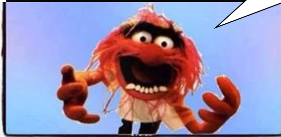
Question for men

Also used the Bethel opportunity to install and test a couple of the new Apco Cruiser chutes - we now have 7 or 8 of those in the club. Their claim to fame is the chute's new design that seems to incorporate the