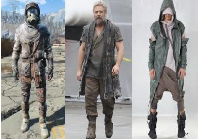
Notice the casual elegance of these classics, and the bold yet understated message they shout!

This is a little more difficult, since men have SO many more fashion opportunities. It's hard to describe what's fashionable today (it changes so much), but here are a few classics that never go out of style.