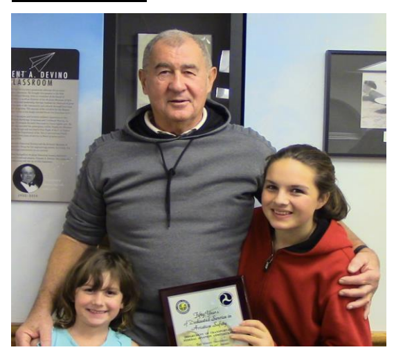
Enough of this award ceremony – let's have dinner!