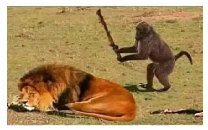
I'm no wildlife expert, but I think this monkey might be drunk.

So obviously, the advantages win, so we'll see you out there!