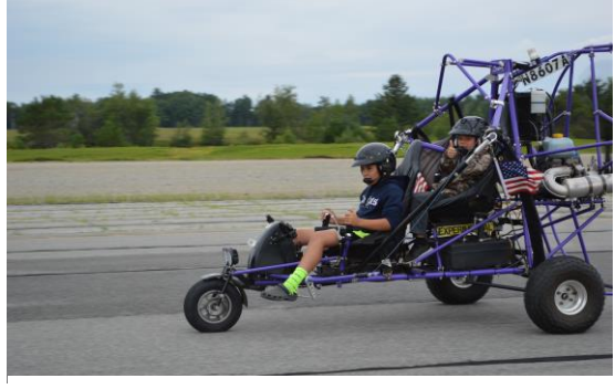
Don't tell dad!