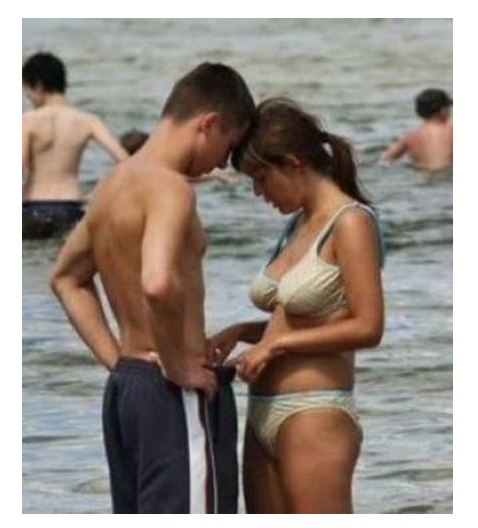
Just verifying the effects of cold water...

- Best way to get a man to do something is to suggest he is too old for it.