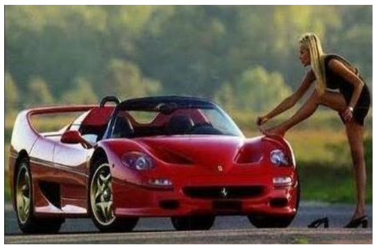
In the long term, the car is cheaper

So I was at this bar last night and the waitress screamed "Anyone know CPR?" I said "Hell, I know the entire alphabet." Everyone laughed. Well, except this one guy