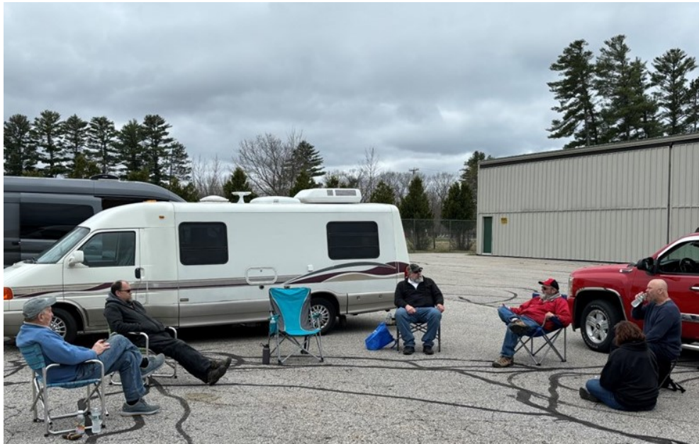
The MPA version of the "Missing man formation"

"Your call is very important to us. Please enjoy this 40-minute flute solo."