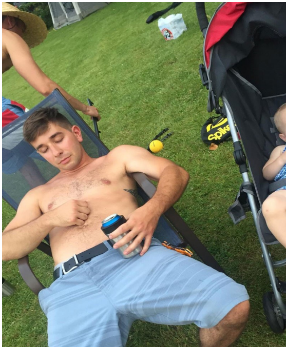
Typical scene at an MPA fly-in

The last issue of the Newsletter displayed this picture. However, since the intern we hired was drunk when he inserted the picture, an important part of it was cut off. So here's the picture the way it should have been.