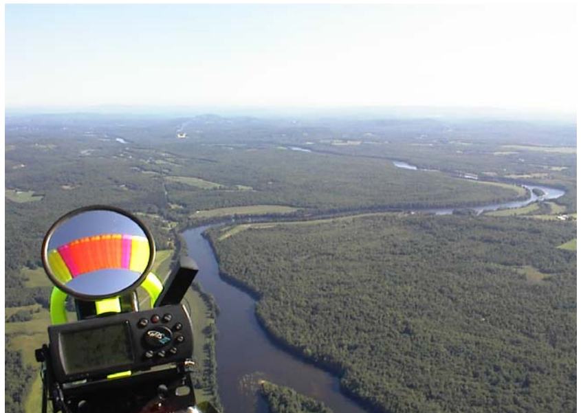
Think Spring

We were asked to correct the implication that it was because of his manly stomach. It was other parts that didn't fit. Sorry!