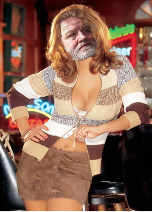
YES – It's the 2002 Miss MPA Winner, representing everything that is great about our organization... brains, good looks, healthy and fit body, dignity, ...