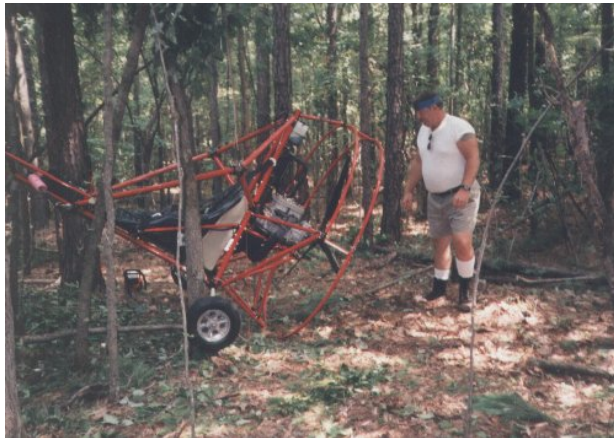
Unknown pilot chewing out his plane for going into the woods to relieve itself without his permission.