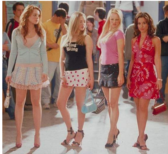
The girls were not happy when told they’d have to dress warmer for winter PPC rides with us. Frostbite in the wrong spots can be devastating!

The pilot and copilot survived and are helping in the recovery efforts.