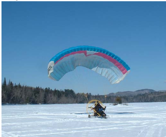
Landing on a spectacular winter day on a lake in northern New Hampshire. Notice the arms frozen in the "Just shoot me now" position.