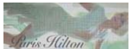
This Newsletter has been officially approved by the Paris Hilton Standards Board

1. Thank you for reading this. Yes, I know, I have to sleep on the couch tonight; but did you know men really don't mind that? It's like camping.