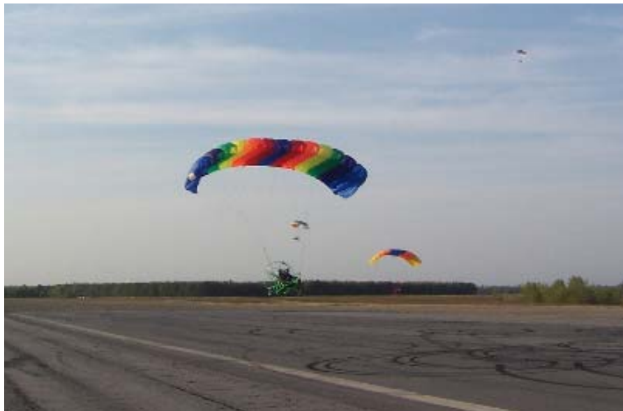
Scene from Deblois by Charles Beck. He violated rule #1 of MPA photography – never take a picture for which no funny caption is possible.

Our next major event and official MPA meeting will be held on July 2 – 4 in Eastport at the fly-in - see next article. At that fly-in, we need to do our annual election of our 4 officers – Safety