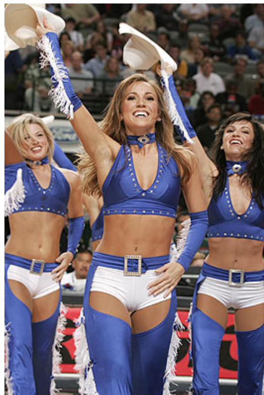
The MPA cheerleading squad practicing for the send-off celebration of our Chute Across Maine adventure in August.

Since we were looking for some worthy Maine based charity organization if possible, the choice of Camp Sunshine seemed like a perfect fit. I contacted them, and they were very happy to participate in this venture with us, and even to associate their name with us! That was a big surprise – obviously, they didn't do their homework.